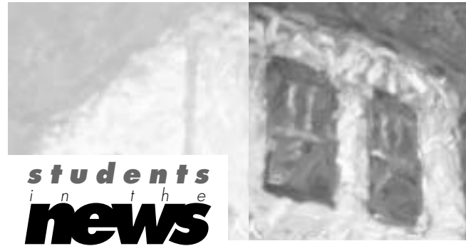
A beautiful painting designed by a NCCC student makes you want to look towards the future